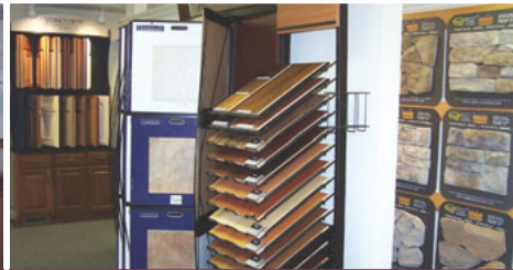
Design Center Showcases included products and popular options.